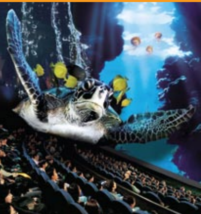
3D Deepsea audience at the IMAX Theatre