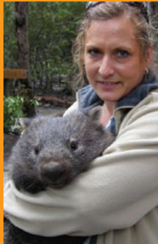
Australia Walkabout Wildlife Park