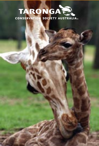
TARONGA CONSERVATION SOCIETY AUSTRALIA